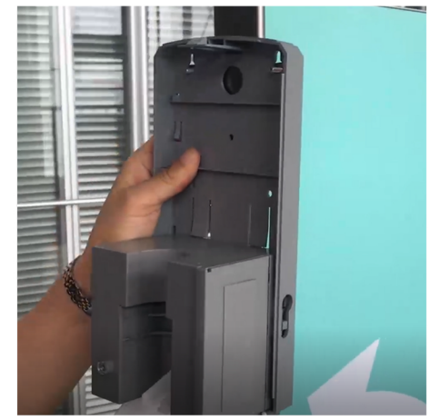
Hook sanitizer dispenser onto the screws of the connector