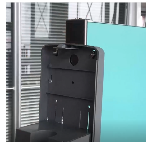
Thread nuts onto connector screws to secure sanitizer dispenser onto the clip