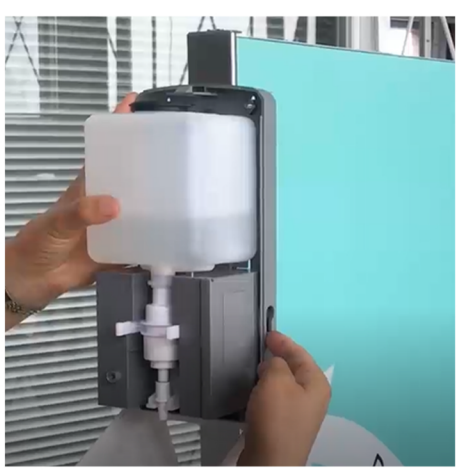
Insert (qty 4) C batteries and turn on side switch to power the dispenser on