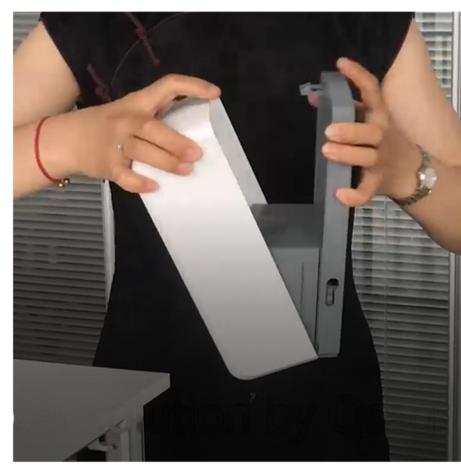
Pull open the sanitizer dispenser