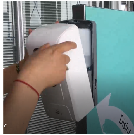
Close dispenser cover and use provided key to lock