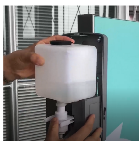
Insert sanitizer tank into the housing