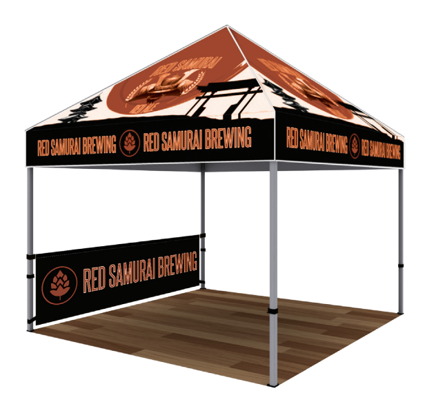
Half Side Wall Double-Sided