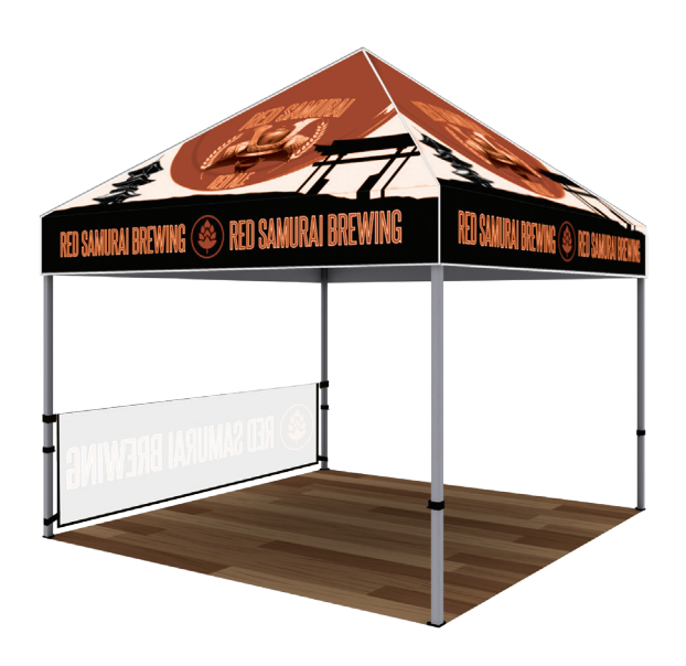
Half Side Wall Single-Sided

PRODUCT CODE: OC-CAS-1HWALLG1-1RAIL & OC-CAS-1HWALLG2-1RAIL