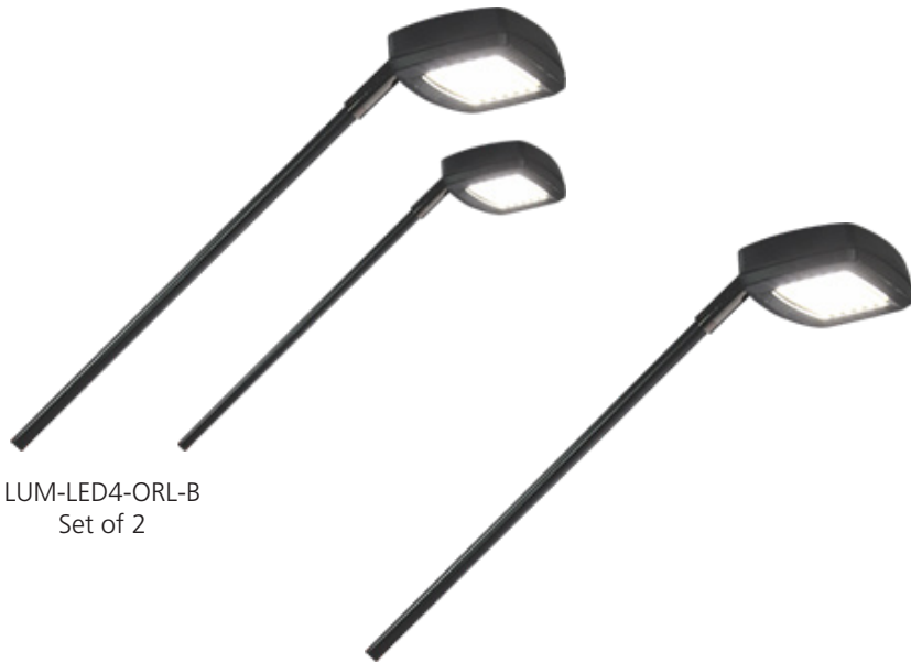
LUM-LED4-ORL-B Set of 2

Lighting can create a powerful, impactful presence or display. Illumination is an important piece of the puzzle to achieve the mood, style and staging that you desire. Incorporate modern, bright LED light into your display and draw attention to your brand and message with elegance. With a contemporary profile, you can modernize your display, set the stage, and better communicate a clear message.